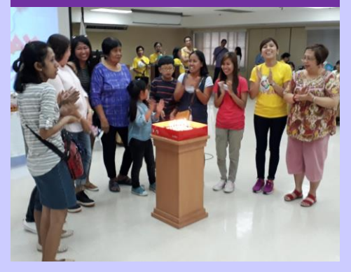
June celebrants were given a surprise! @