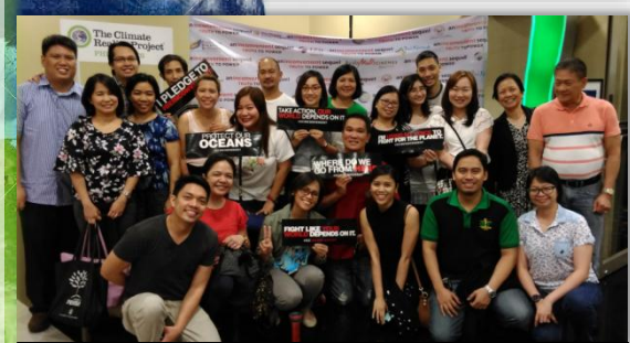
The UST Section of Rheumatology along with guest advocates for climate change awareness.