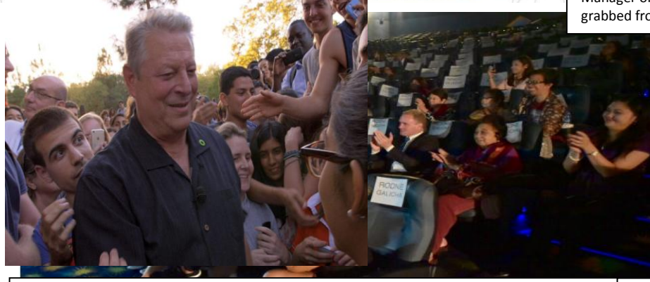
Environmental advocates at the premiere screening of the "An Inconvenient Sequel" featuring former US vice-president Al Gore..