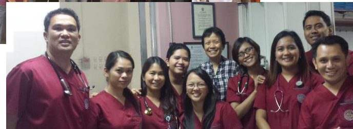
Rheumatology Lifestyle Report 2015