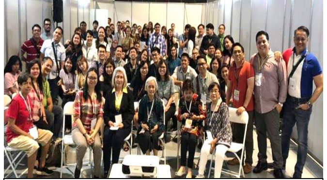
The patient-partners, facilitators, and Doctors who attended the workshop

Overall, the workshop was very productive, educational and fun!