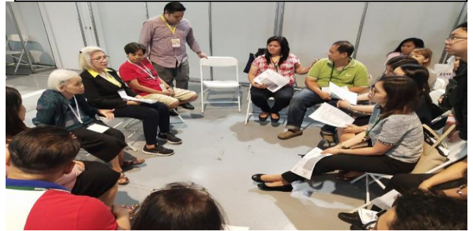
Photo Gallery: Up Close and Personal with Patient Partners in Rheumatology