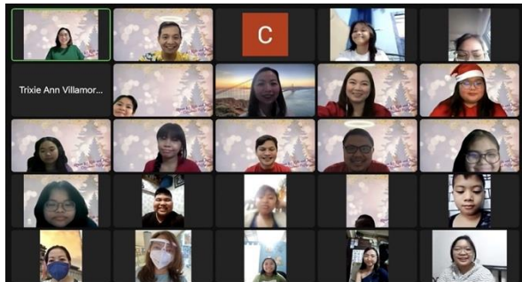
Pic 2 – Participants